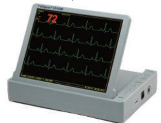
10.5" Monitor Weight: 1.2 kg Dimensions: 28 x 20 x 5 cm